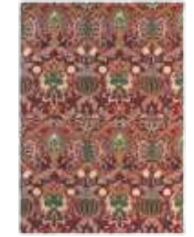
Granada 27600 Red / Black