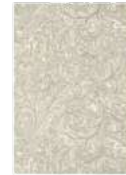
Bachelors Button 28209 Linen