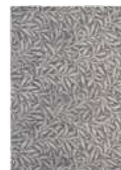
Willow Bough 28305 Granite

London Showroom Chelsea Harbour Design Centre - London SW10 0XE t + 44 844 543 4749 - enquiries@a-sanderson.co.uk