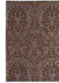
Autumn Flowers 27500 Plum