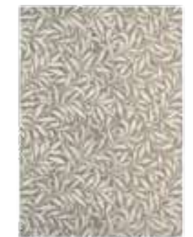
Willow Bough 28304 Mole