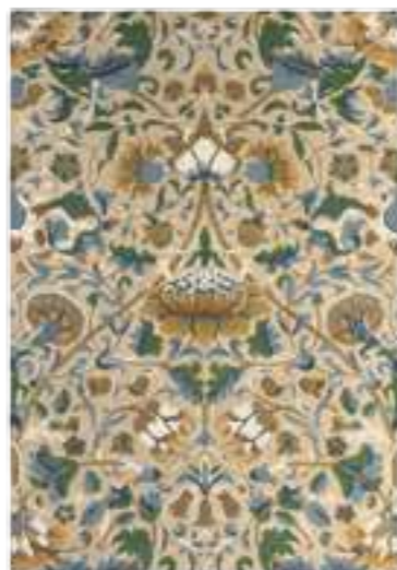
Lodden 27801 Manilla

LODDEN Handtufted Pure new wool 140 x 200 cm 170 x 240 cm 200 x 280 cm Custom sizes on request