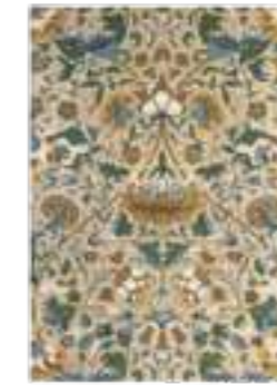
Lodden 27801 Manilla