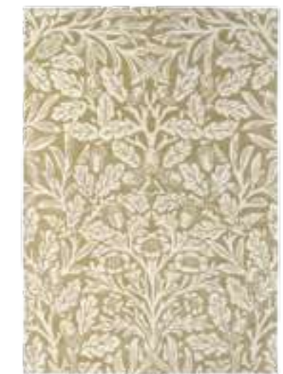
Oak 27904 Linen

OAK Handtufted Pure new wool 140 x 200 cm 170 x 240 cm 200 x 280 cm Custom sizes on request