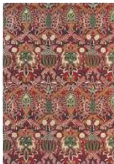
Granada 27600 Red / Black

GRANADA Handtufted Pure new wool 140 x 200 cm 170 x 240 cm 200 x 280 cm Custom sizes on request