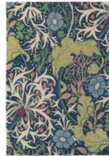
Seaweed 28008 Ink

SEAWEED Handtufted Pure new wool/viscose 140 x 200 cm 170 x 240 cm 200 x 280 cm Custom sizes on request