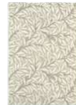
Willow Bough 28309 Ivory