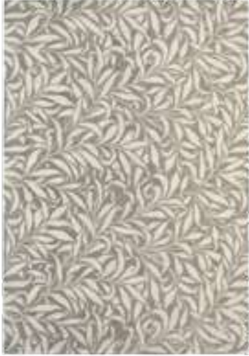
Willow Bough 28304 Mole