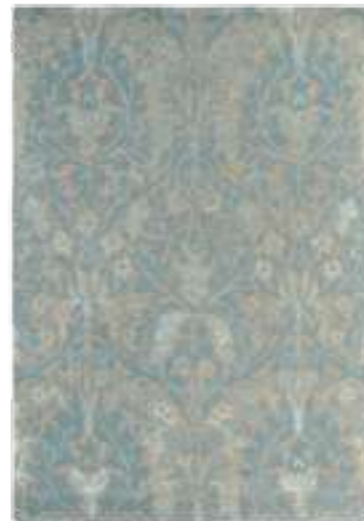
Autumn Flowers 27508 Eggshell