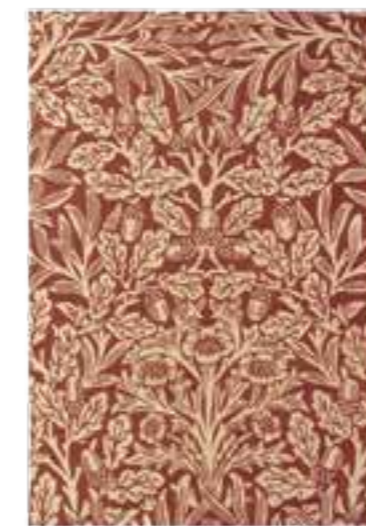
Oak 27900 Crimson