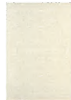
Ceiling 28609 Parchment