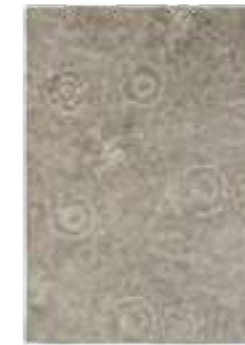
Poppy 28405 Taupe