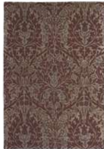
Autumn Flowers 27500 Plum

AUTUMN FLOWERS Handtufted Pure new wool/viscose 140 x 200 cm 170 x 240 cm 200 x 280 cm Custom sizes on request