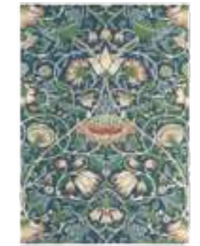
Lodden 27808 Indigo / Mineral