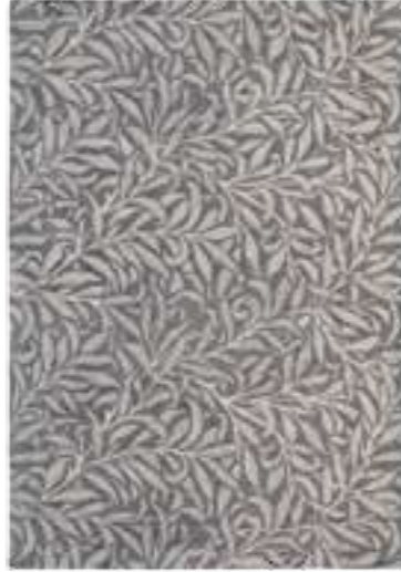
Willow Bough 28305 Granite