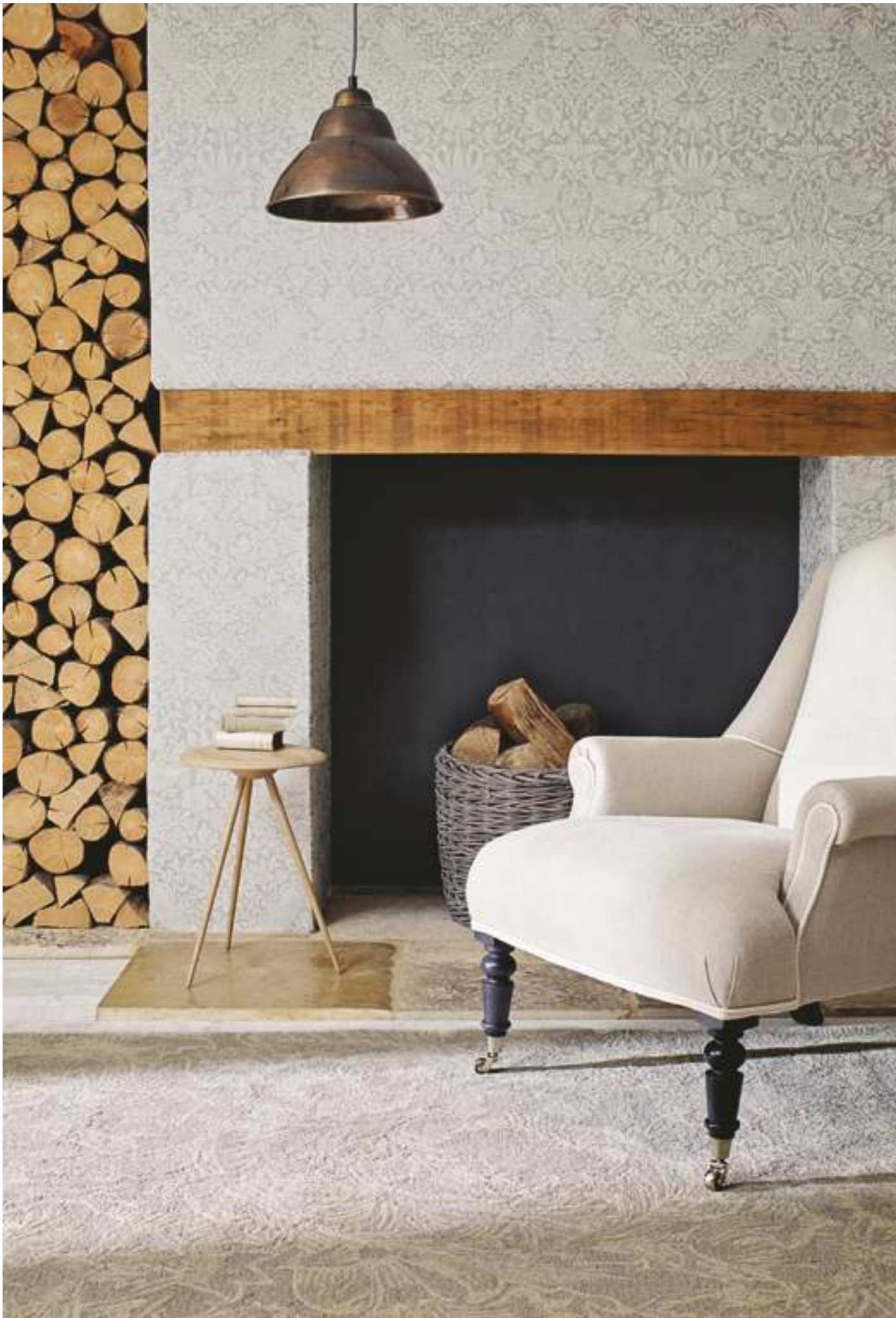
Poppy 28404 Dove