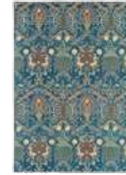
Granada 27608 Indigo / Red