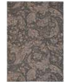
Bachelors Button 28205 Charcoal