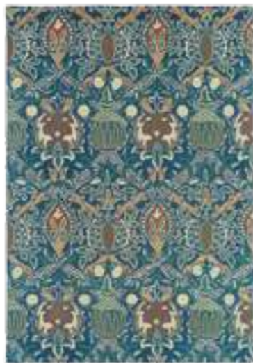
Granada 27608 Indigo / Red