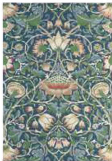
Lodden 27808 Indigo / Mineral

GRANADA Handtufted Pure new wool 140 x 200 cm 170 x 240 cm 200 x 280 cm Custom sizes on request