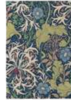
Seaweed 28008 Ink