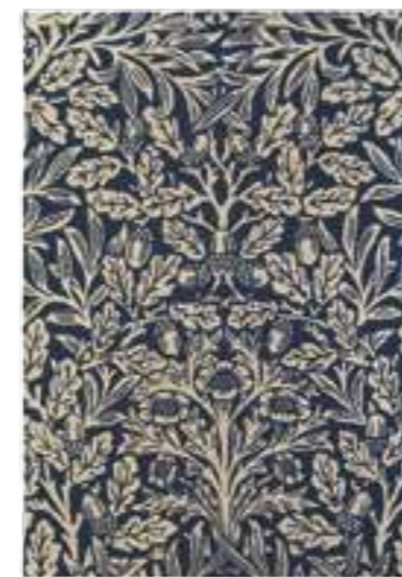
Oak 27908 Indigo

SEAWEED Handtufted Pure new wool/viscose 140 x 200 cm 170 x 240 cm 200 x 280 cm Custom sizes on request