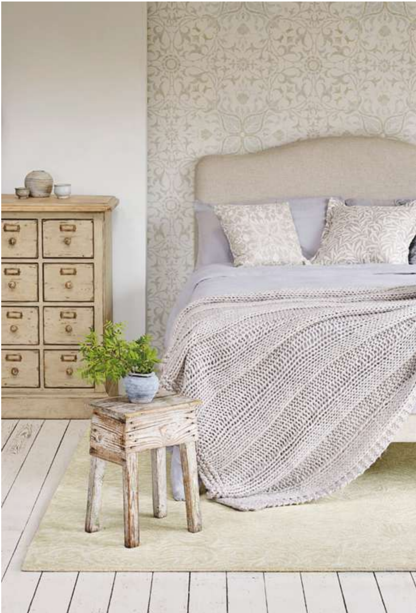
Ceiling 28501 Taupe