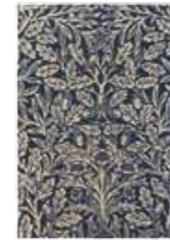
Oak 27908 Indigo