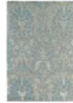
Autumn Flowers 27508 Eggshell