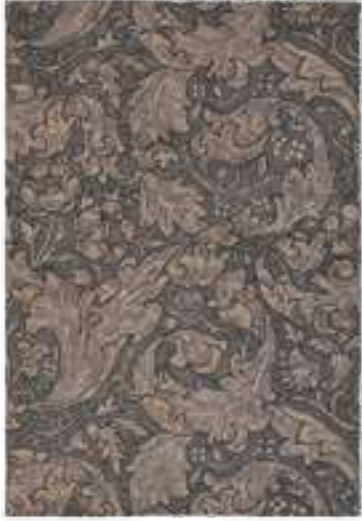
Bachelors Button 28205 Charcoal