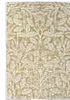
Oak 27904 Linen