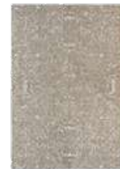
Ceiling 28501 Taupe