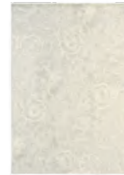
Poppy 28409 Cream