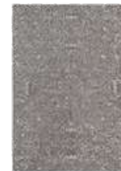
Ceiling 28505 Charcoal