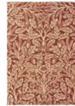
Oak 27900 Crimson