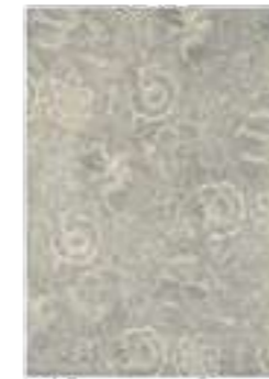
Poppy 28404 Dove