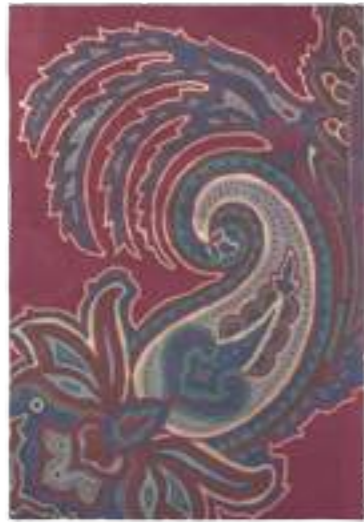
Paisley Burgundy 57500