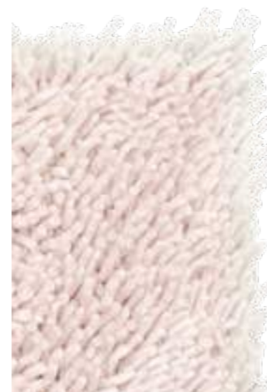
Felted Nude 58802

Axminster-woven in a mix of soft pastels, these highly contemporary and tactile rugs are versatile and enticing, making them an ideal focal point in any room.