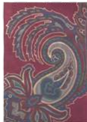
Paisley Burgundy 57500