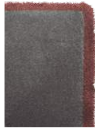
Luxe Charcoal 58705