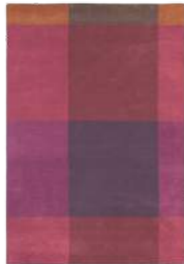
Plaid Burgundy 57805