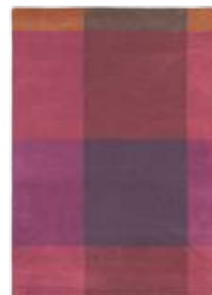
Plaid Burgundy 57800