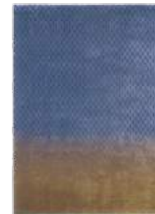
Dipgeo Blue 58408