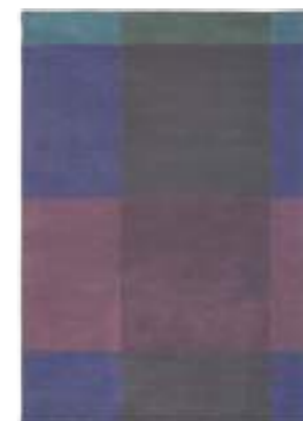
Plaid Navy 57808

Designs shown are based on size 170 x 240, patterns for other sizes may differ Minimum order quantity for special sizes is 2 square metres Deviations up to 5% in the sizes are possible