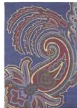
Paisley Navy 57508