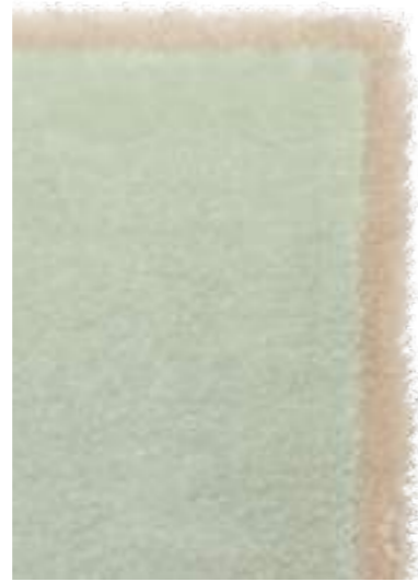
Luxe Mint 58707