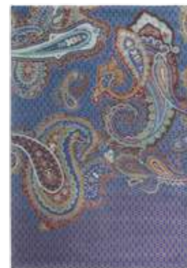
Paisgeo Blue 58608

Pure new wool / Tencel 140 x 200 cm - 170 x 240 cm - 200 x 280 cm