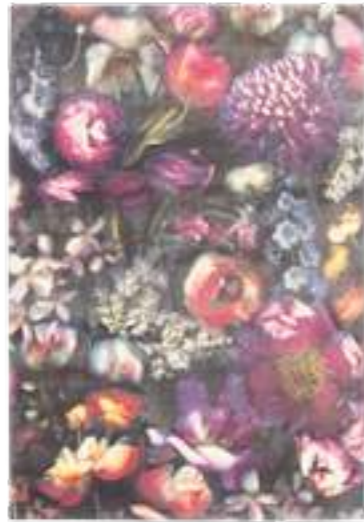
Shadow Floral 58005