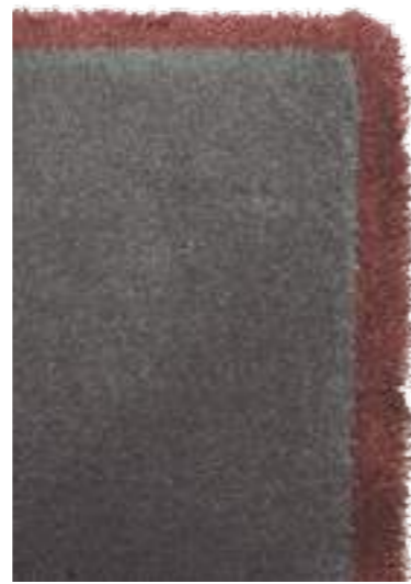
Luxe Charcoal 58705