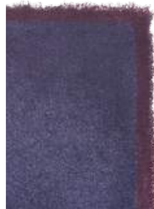
Luxe Dark Navy 58708