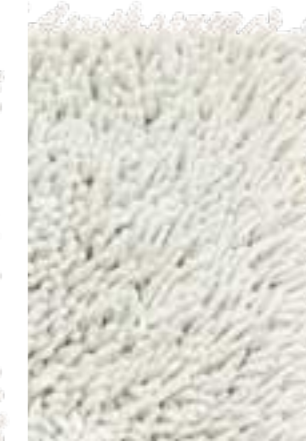
Felted Mint 58807