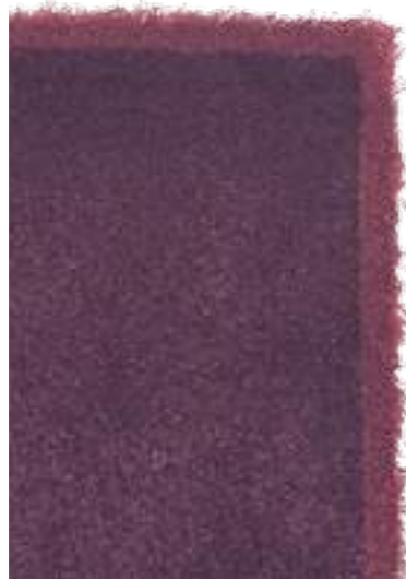
Luxe Aubergine 58715