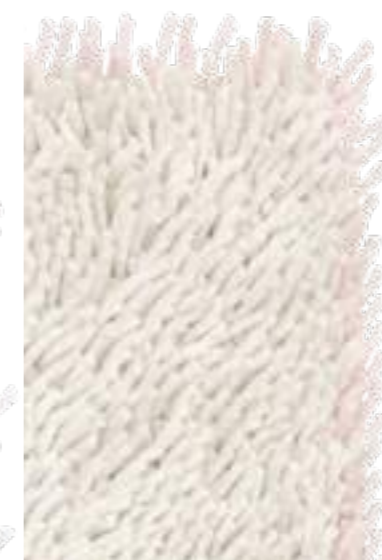
Felted Ecrú 58804