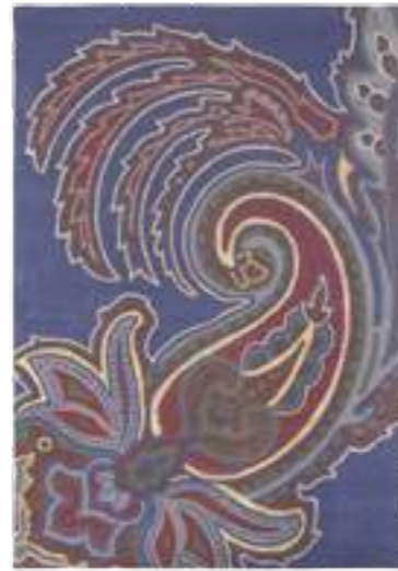
Paisley Navy 57508