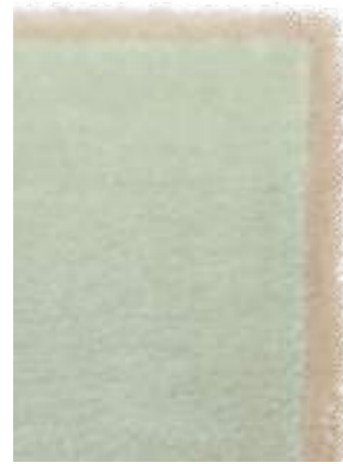
Luxe Mint 58707