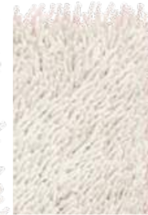
Felted Ecu 58804