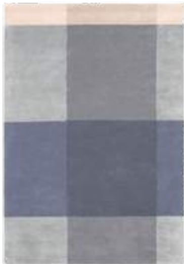
Plaid Grey 57804