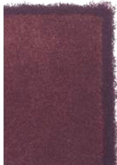
Luxe Burgundy 58700

Pure new wool / Tencel All sizes on request (maximum of 4,5 x 9 metres)