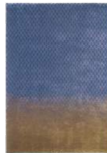
Dipgeo Blue 58408