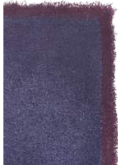
Luxe Dark Navy 58708