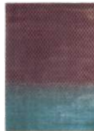
Dipgeo Rust 58405