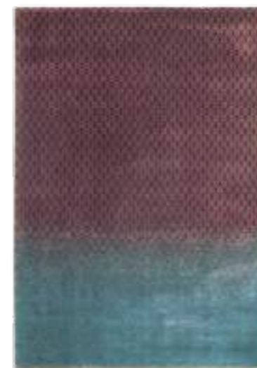
Dipgeo Rust 58405