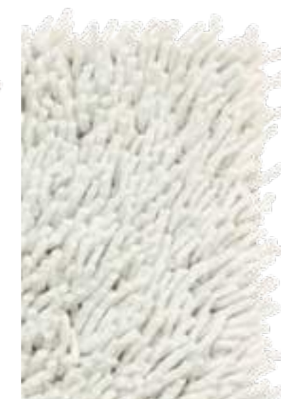
Felted Mint 58807

Pure new wool / Viscose 140 x 200 cm - 170 x 240 cm - 200 x 280 cm - Custom sizes on request