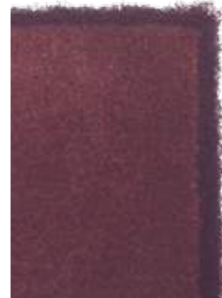
Luxe Burgundy 58700