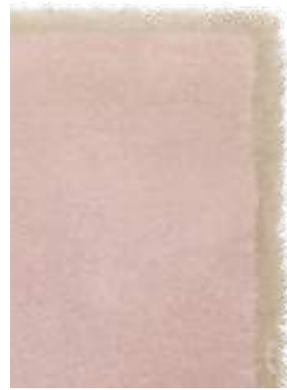
Luxe Nude 58702