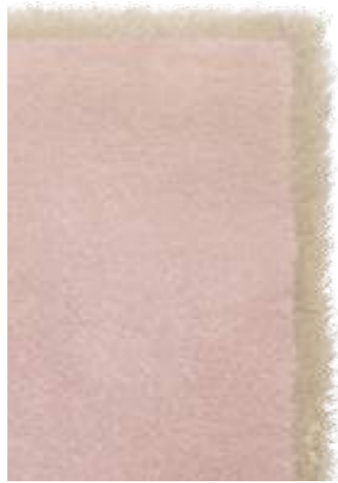
Luxe Nude 58702