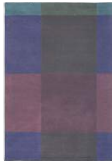
Plaid Navy 57808

Pure new wool - Paisley 575 has details in viscose 140 x 200 cm - 170 x 240 cm - 200 x 280 cm - Custom sizes on request