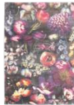
Shadow Floral 58005