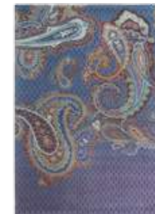
Paisgeo Blue 58608