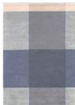
Plaid Grey 57804