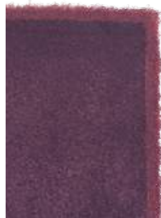
Luxe Aubergine 58715